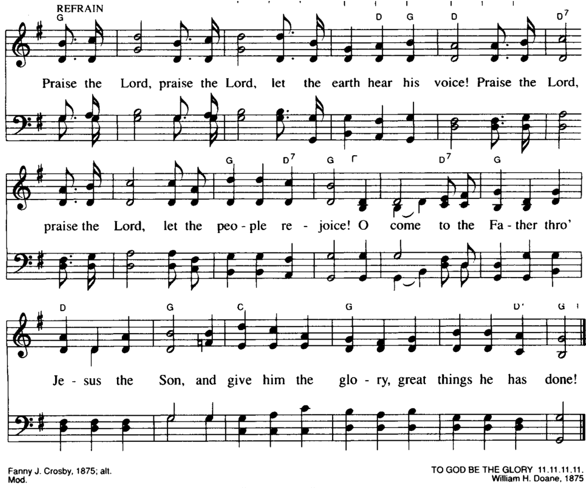
CCLI License #3061564 Song #23426 Public Domain