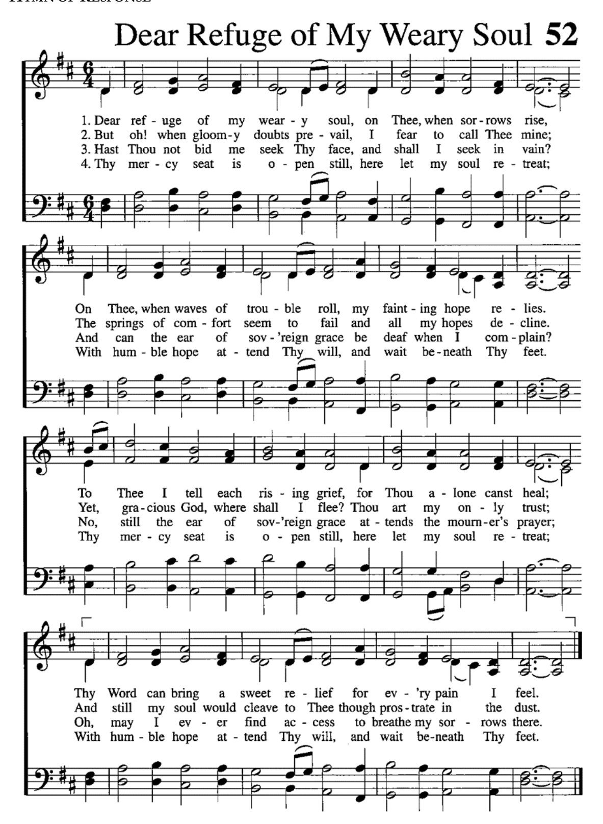
CCLI License #3061564 Song #7016164 Matt Merker