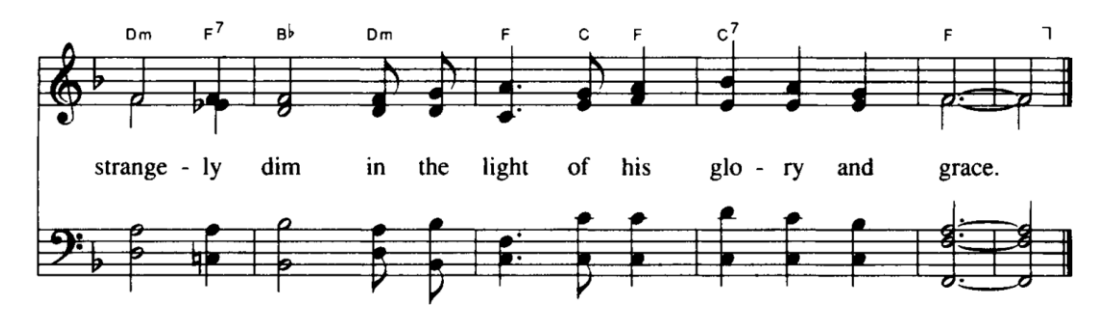
CCLI License #3061564 Song #15960 Public Domain LEMMEL