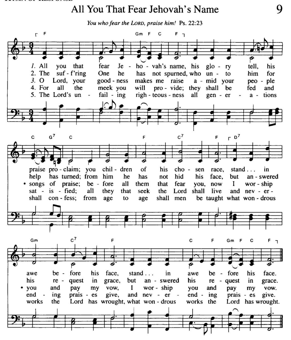
CCLI License #3061564 Song # 744080 Public Domain | PARK STREET