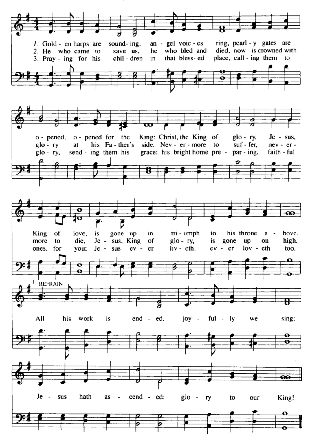
CCLI License #3061564 Public Domain | HERMAS

Christ ... entered heaven itself, now to appear for us in God's presence. Heb. 9:24