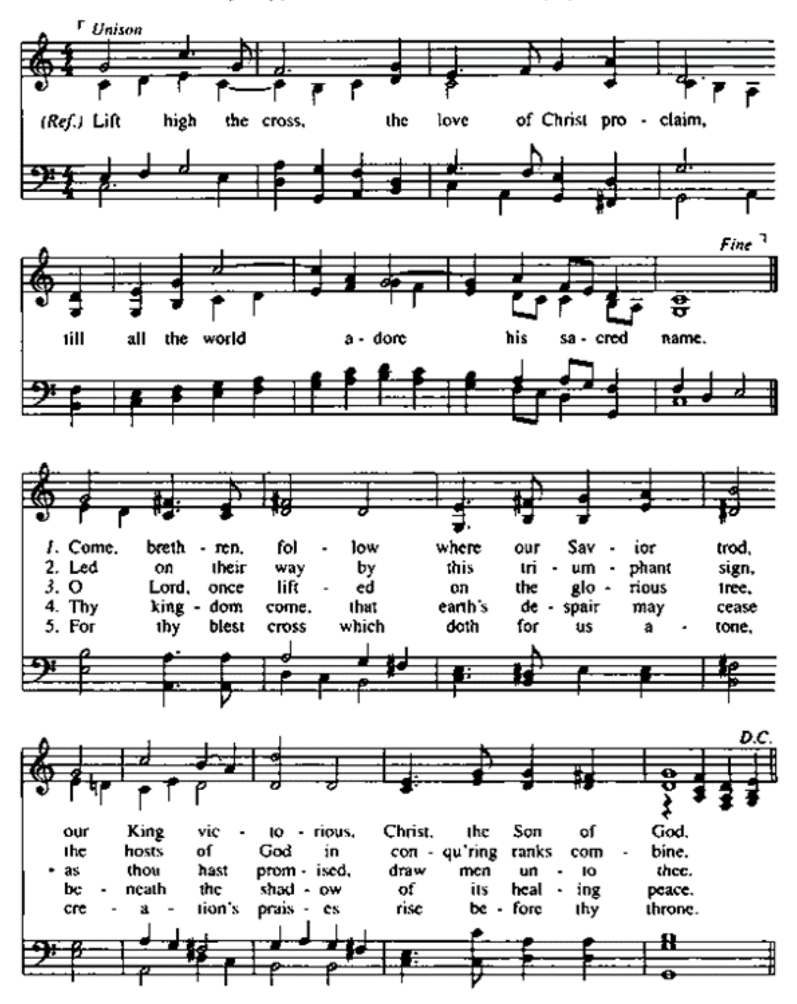
CCLI License #3061564 Song#5169 | CRUCIFER

I, when I am lifted up from the earth, will draw all men to myself. John 12:32