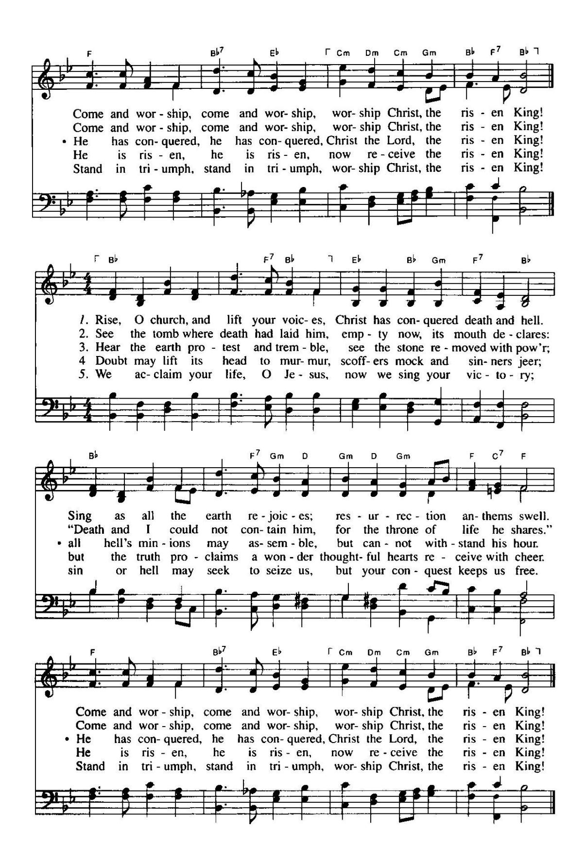
PRAYER OF ADORATION AND INVOCATION