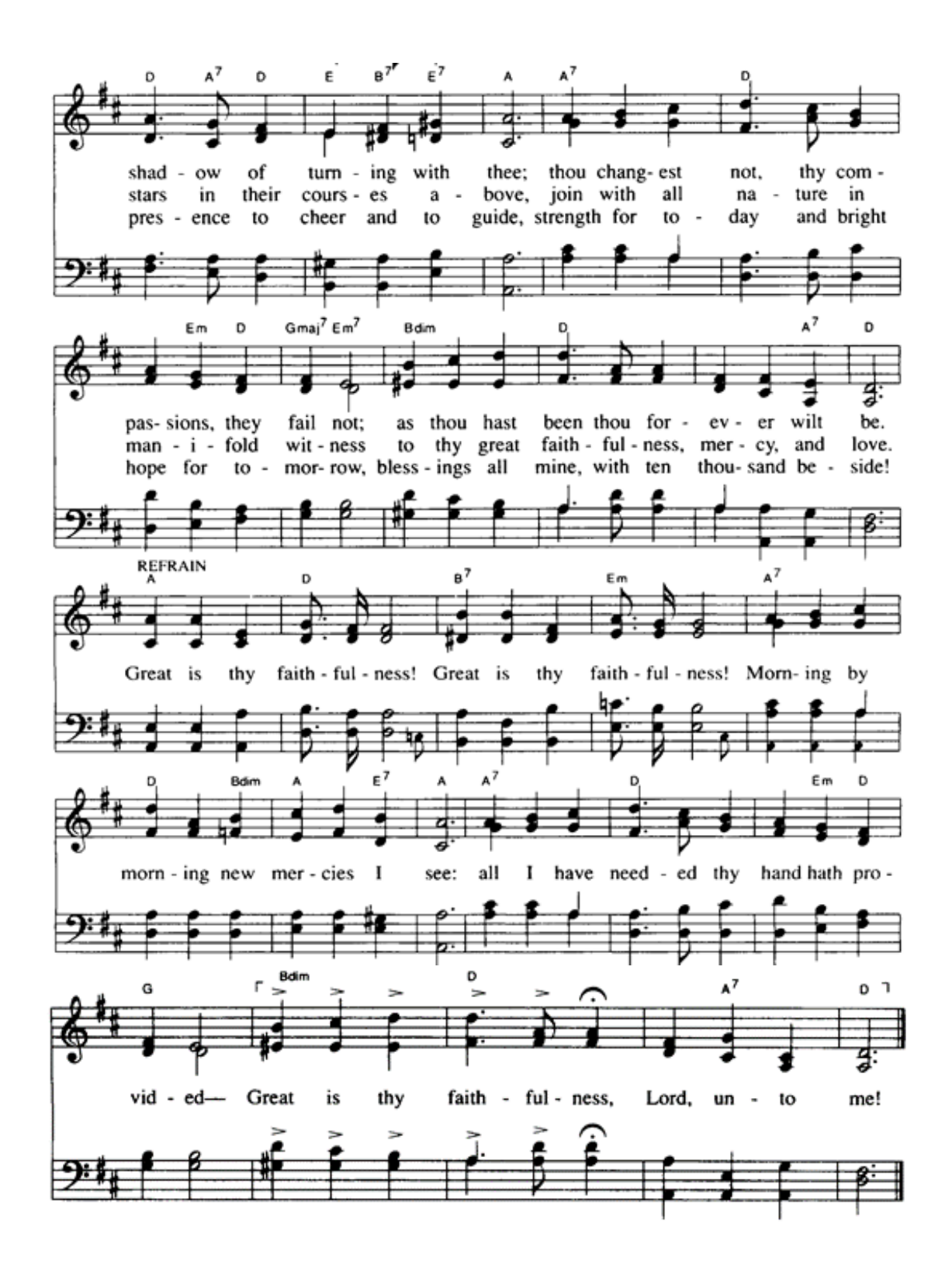
PRAYER OF ADORATION AND INVOCATION