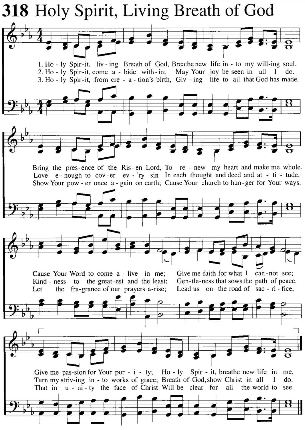
Words and Music: Keith Getty and Stuart Townend

© 2006 Thankyou Music (PRS) (adm. worldwide at CapitolCMGPublishing.com excluding Europe which is adm. by Integritymusic.com). All rights reserved. Used by permission.