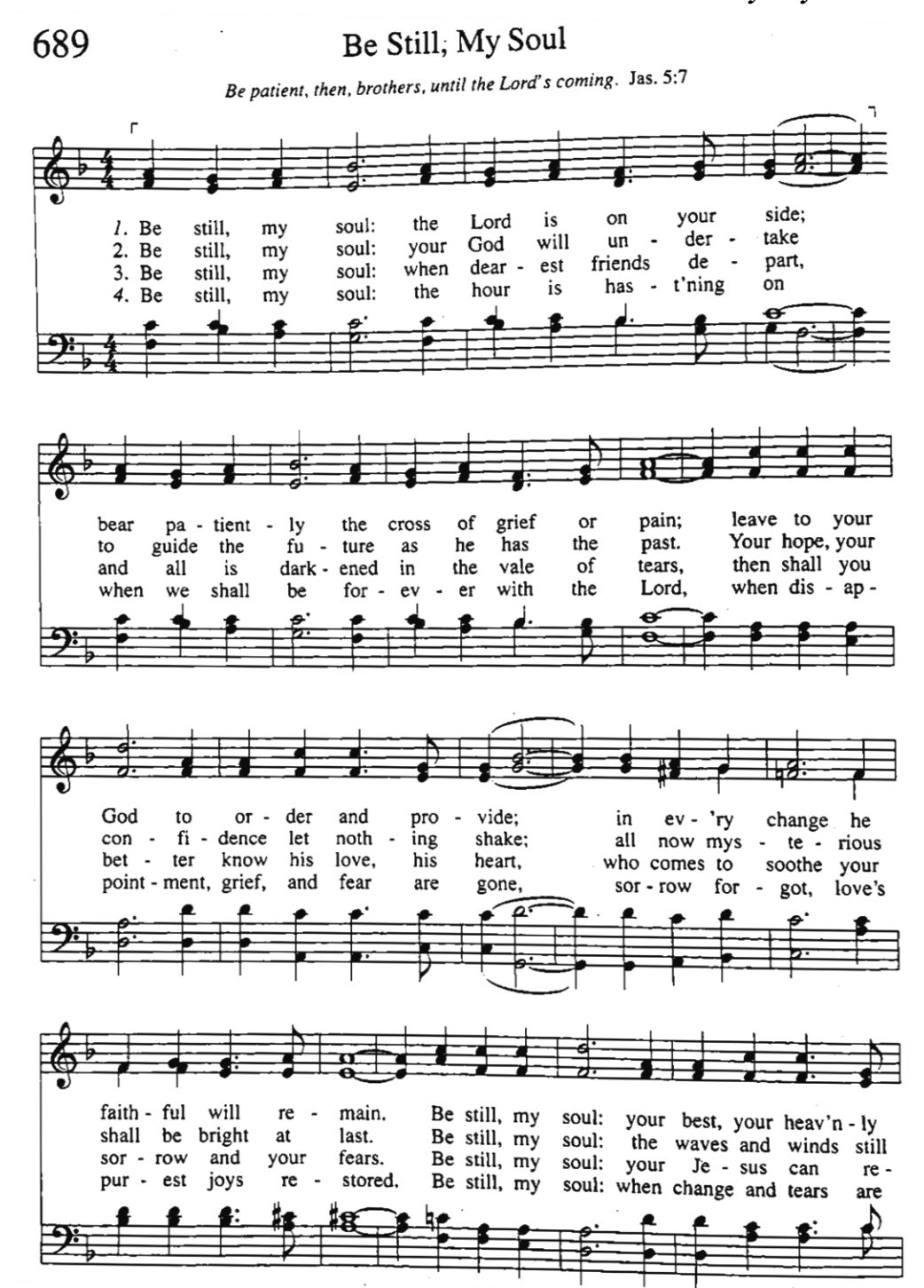
Trinity Hymnal No. 689