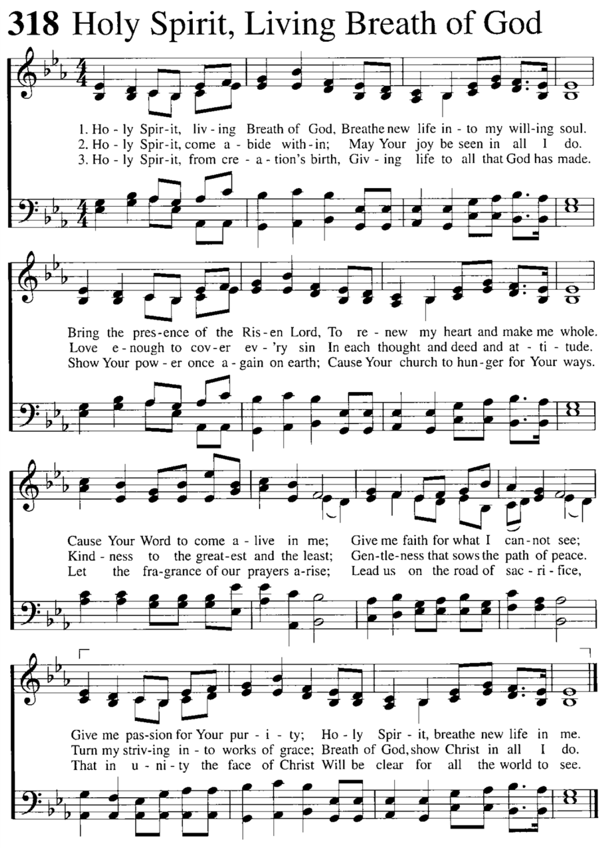
Words and Music: Keith Getty and Stuart Townend

© 2006 Thankyou Music (PRS) (adm. worldwide at CapitolCMGPublishing.com excluding Europe which is adm. by Integritymusic.com). All rights reserved. Used by permission.